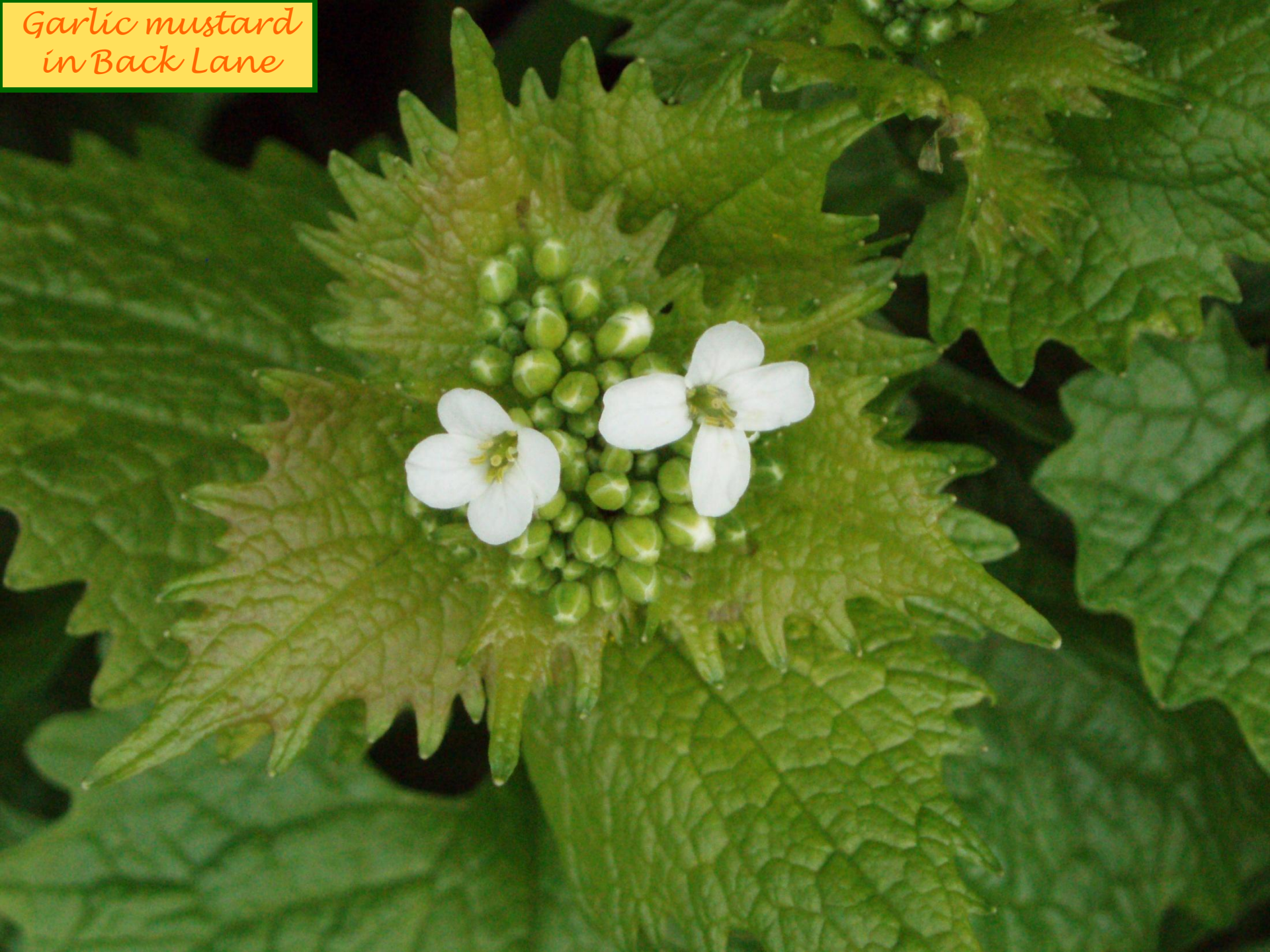
Garlic mustard in Back Lane